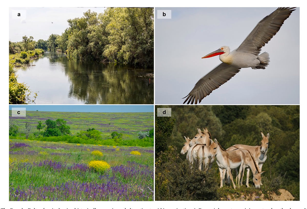
Fig. 1. (a) The Danube Delta, despite having historically experienced alteration to aid in navigation, is Europe's largest remaining natural wetland area. It is regarded by WWF as one of the 200 most valuable ecological areas on Earth (World Wildlife Fund, 2020a). (b) The Dalmatian Pelican ( Pelecanus crispus ) has seen declining numbers during the last century (Catsadorakis, 2019). It requires minimum disturbance to nest, nesting on islands or reedbeds surrounded by water (Crivelli, 1996), and the Danube Delta is an important site for the global conservation of the species, hosting most of Europe's remaining population (Endangered Landscapes Programme, 2020a). (c) Located 50 km northeast of the wetlands, yet functionally connected to it, is the Tarutino steppe, which is the largest remaining tract of Eurasian Pontic Steppe and protected together with the delta (Endangered Landscapes Programme, 2020a). (d) Kulan ( Equus hemionus kulan ) had been missing from the ecosystem for hundreds of years, mainly due to hunting (Endangered Landscapes Programme, 2020b) and agricultural development but has now been reintroduced to the Tarutino steppe (Endangered Landscapes Programme, 2020a). It will aid in keeping the steppe open, while forming an additional prey base for native predators (Endangered Landscapes Programme, 2020a). It will aid in keeping the steppe open, while forming the steppe with the wetlands, as they migrate between them (Endangered Landscapes Programme, 2020a).

On the border between Ukraine and Romania, the Danube Delta is Europe's largest remaining natural wetland complex (World Wildlife Fund, 2020a) (Fig. 1). The delta harbors the greatest number of fish species in Europe, including four species of endangered sturgeon, supports innumerable water birds, and provides irreplaceable resting grounds on the great Palearctic-African migration flyway connecting northern Europe and Africa (Rewilding Europe, 2021b). Partially developed for industrial agriculture during the second half of the twentieth century, the regions surrounding the delta experienced decreasing populations during the past three decades, on both the Romanian (Eurostat, 2020) and Ukrainian sides (Brinkhoff, 2021). Large areas of agricultural land were abandoned, often in a deteriorated state but with excellent opportunities to revive the natural landscape. Dikes have been removed, low-lying areas reflooded, and spawning areas restored, greatly increasing fish and waterfowl numbers (World Wildlife Fund, 2020b). Many species have been actively reintroduced, including the Eagle Owl (Bubo bubo) and the iconic Dalmatian Pelican (Pelecanus crispus), wild konik horses (Equus ferus caballus) and water buffalo (Bubalus bubalis), and the kulan (wild ass, Equus hemionus kulan) in adjacent upland steppes (Endangered Landscapes Programme, 2020a). Because fertility rates remain low in Romania and Ukraine (United